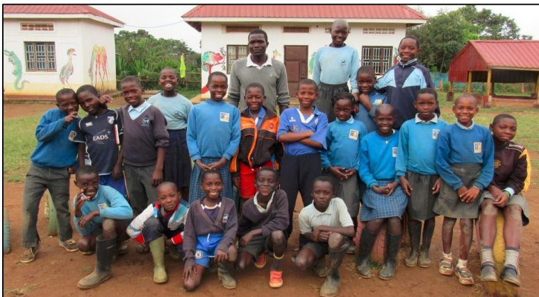
Primary Four Class