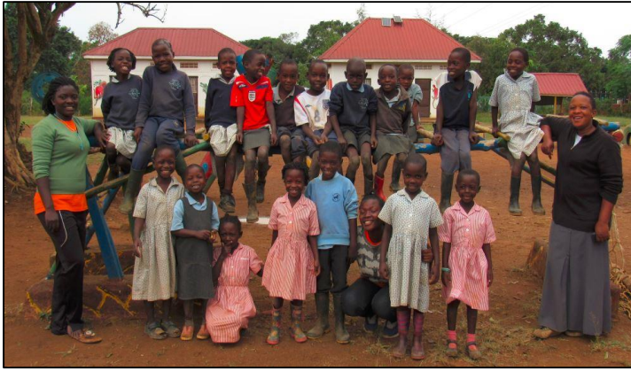
Primary Two Class