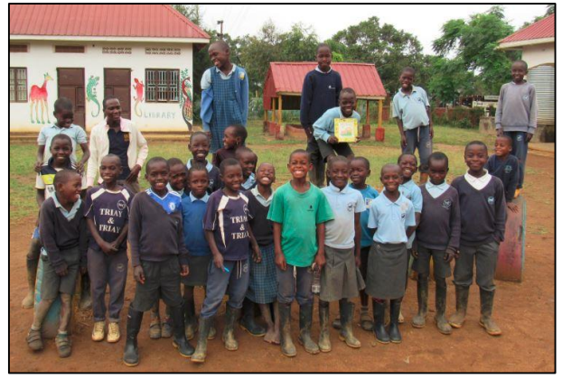
Primary Three Class